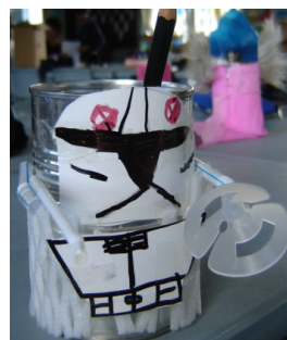
Edward Hawrot's clone

Reusing materials to make something new is part of the Zero Waste Education Programme. Here students have used old cans to create beautiful and imaginative pen and pencil holders.